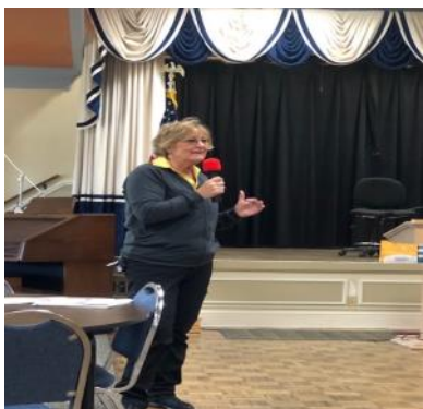
POLK CO. FIRE DEPARTMENT SAFETY TIPS FOR SENIORS