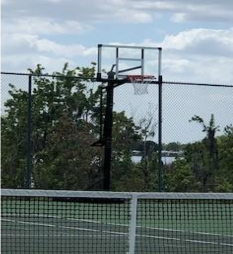
Basketball Hoop Completed